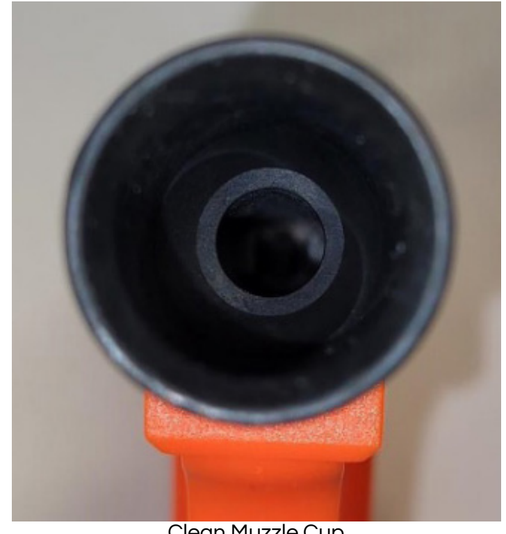
Clean Muzzle Cup

The Muzzle Cup can be cleaned by using a Wire Muzzle Brush (#5703) and M-Pro 7 (#5700). It is very important this area of the launcher is kept clean. Pyrotechnics should NEVER fit snuggly. Pyro cartridges should always be loose to ensure proper flight.