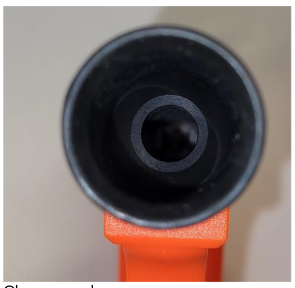
Clean muzzle cup

The Muzzle Cup can be cleaned by using a Wire Muzzle bush (#5703) and M-Pro 7 (#5700). It is very important this area of the launcher is kept clean. Pyrotechnics should NEVER fit snuggly. Pyro cartridges should always be loose to ensure proper flight.